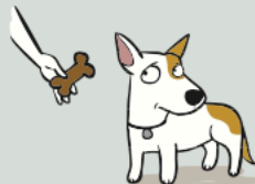
Suddenly Won't Eat but was hungry earlier