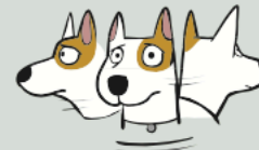
Hypervigilant looking in many directions