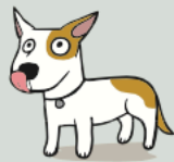
Licking Lips when no food nearby