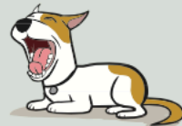
Acting Sleepy or Yawning when they shouldn't be tired