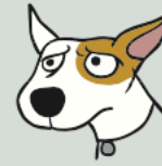
Brows Furrowed, Ears to Side