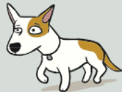
Moving in Slow Motion walking slow on floor