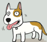
Panting when not hot or thirsty